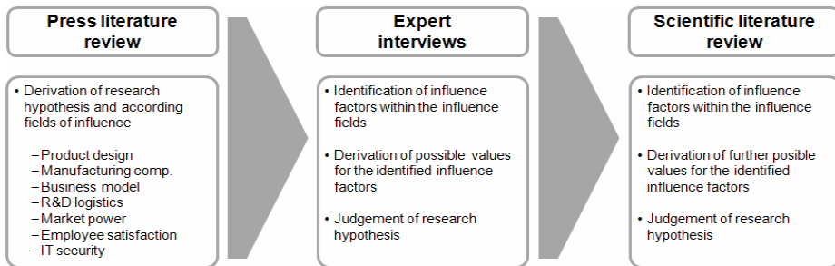
Figure 2. Study design

In the first step, press releases and articles were analyzed as well as industrial literature, which is necessary in the fields of know-how protection and product imitation as information in these fields is not published scientifically but in daily newspapers and magazines. The results of the research hypothesis were used to deduct the research hypotheses.