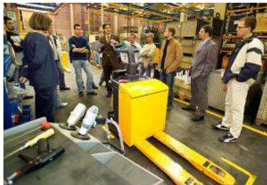
Figure 3: Excursion in the beginning of the course [Jungheinrich]

The "Roter Faden" begins with an excursion to Jungheinrich during the first term. The students are just beginning to orientate themselves and should be introduced to the leitmotif at an early stage. The aim of this excursion is to familiarise the student with the technical product and a business context. Thus the students experience the company, the pedestrian fork lift truck, its development, its production, its marketing and the customers at first hand. The students already receive their first impression of business processes and the connections between the different disciplines during this excursion. Especially with the pedestrian fork lift truck chosen, the interaction between electrics and ME-Mechanics is very close and aimed directly at the needs of the consumer.