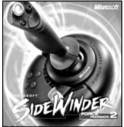
Figure 2. The SideWinder Force-Feedback joystick from Microsoft

commercially available and robust enough to be used by the general public. Haptic devices, nowadays, are incorporated into mainstream computing devices, such as the Microsoft Force Feedback joystick (Figure 2), which promotes the acceptance of this technology into the 'daily computer experience' of people with and without disabilities. Effectively, this adds a further strand to human-computer communication so that data can be accessed and literally manipulated not just through visual means, but also through tactile senses [Hayward in Paterson, 1998].