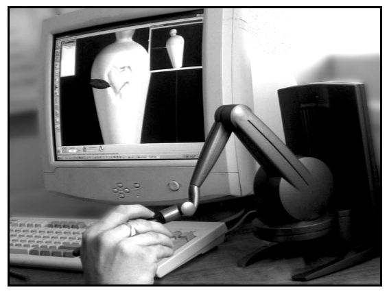
Figure 3. The PHANToM haptic device from SensAble Technologies

The PHANToM provides single point, 3D force-feedback to the user via a stylus attached to a moveable arm (Figure 3). It can be used not only to interact intuitively with virtual models, but also to interact with such models in 3D space, allowing hand and eye to work together on the model. The position of the stylus point/fingertip is tracked, and resistive force is applied to it when the device comes into 'contact' with the virtual model, providing realistic force feedback. The physical working space is determined by the extent of the arm [SensAble, 2002].